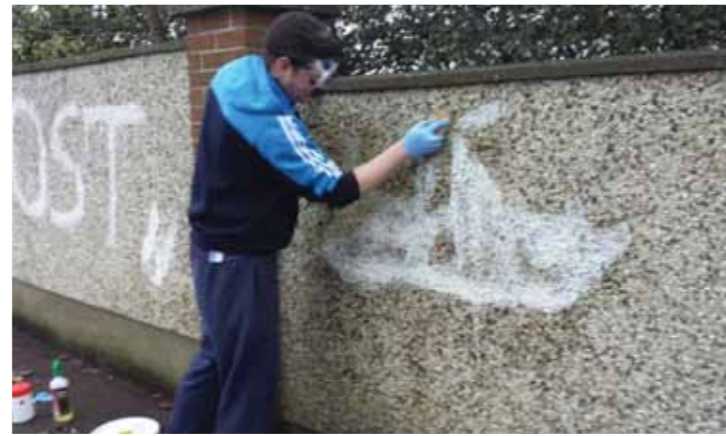
Cleaning Graffiti in College Grove.

Adopt A Patch is an initiative by Fingal Co Council which allows volunteer groups to maintain an area if the council are short on resources. The council will provide the equipment and volunteer groups can participate in clean ups. I have been involved in organising several of these events in recent months. If there is an area that people think could benefit from such an initiative, please contact me and I will organise it, if viable.